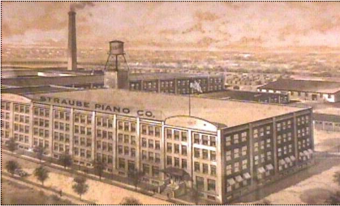
A portion of the expanded factory building.

Just over one hundred years ago the city's bleak future got brighter with the opening of the brand new Straube Piano Factory on Wednesday, October 12, 1904. Back just after the turn of the twentieth century, 1901 to be exact, the city had lost its major employer and most of its economic base with the fire that had all but destroyed the George H. Hammond Packing Company.