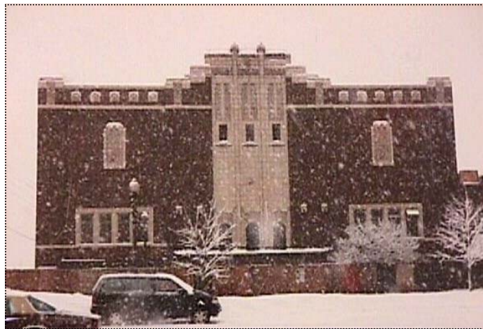
Paramount Theater seen here in January 1991.

In October 1987, two young men from Hobart envisioned a performing arts center and asked the city for aid to help make the project a reality. Costs estimates were around $1.5 million and that included a new roof, new seats and a new heating and air conditioning system. The city was in agreement with the plan. Their fears were that if nothing was done the building would have to be leveled. The main sticking point was, you guessed it, money or the lack of it. Least to say the project never got off the ground.