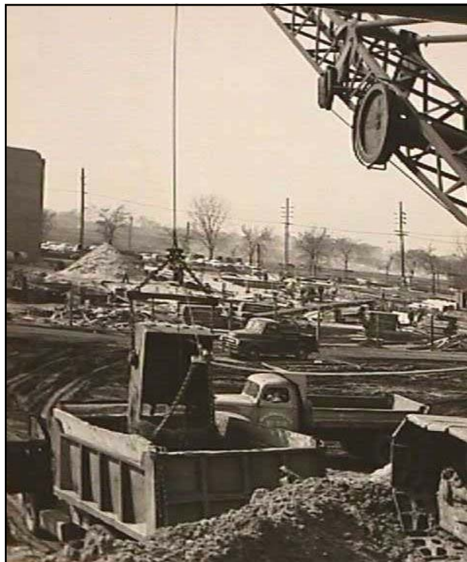
Construction begins on the new Hammond Technical Vocational High School north of the Civic Center on Sohl Avenue.

School board members and school trustees had a different site in mind; they were in favor of the school to be built just north of the Civic Center facing Carroll Street. Many civic leaders thought that this site was too small to build the school.