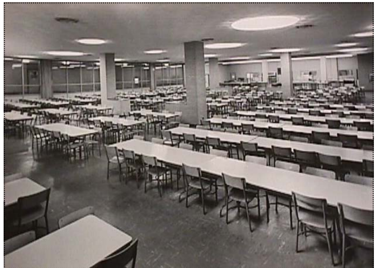
Hammond Tech High School cafeteria circa early 1950's.

Make plans to attend our Annual Dinner and Meeting, this year's event will be special. Our hosts will prepare and cook our meal. It was agreed by members of the board that the money collected by those in attendance will be donated to the congregation for all of their efforts. New board members will be elected and installed for next year. We look forward to seeing you in attendance.