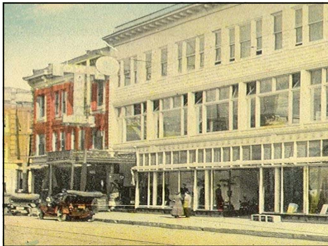
The Towle Opera House entrance, located at the large "T" shaped sign.

Now the Towle Opera House is reborn as the Towle Community Theatre.