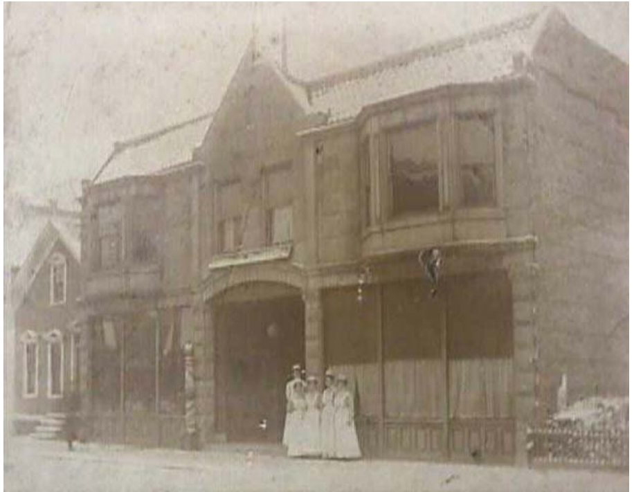
This photograph from 1906 shows a group of nurses from the Hammond Hospital posing for the camera. Note the small frame cottage to the left of the building.